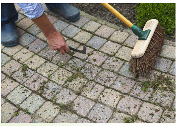
Sweep it up! Fertilizer left on streets and sidewalks can be a major contributor to phosphorus loads in lakes and rivers.