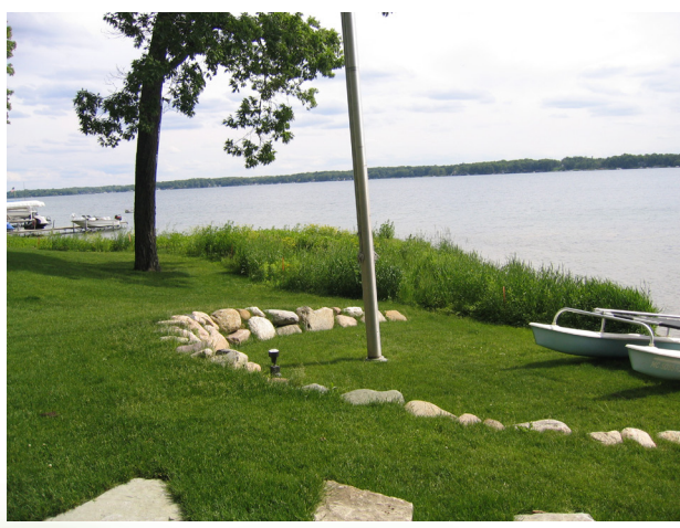
Phosphorus runoff can have negative effects on water quality, fisheries and recreation.

Phosphorus is a naturally occurring essential nutrient for plant and animal growth. It is also a primary water quality concern in Michigan. When excess phosphorus is applied on land, it may run into nearby lakes, rivers and streams. This runoff can lead to increased algae and aquatic plant growth which can have negative effects on water quality, fisheries, recreation, and property values. By restricting unnecessary phosphorus applications, the phosphorus law will help maintain and protect Michigan's vast water resources.